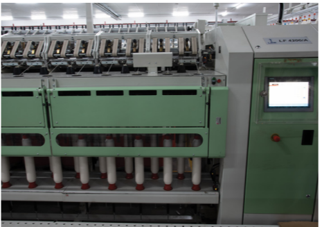
Speed Frame LF4200A