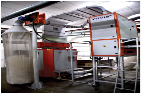
Contamination Clearer VETAL-Combo Scan