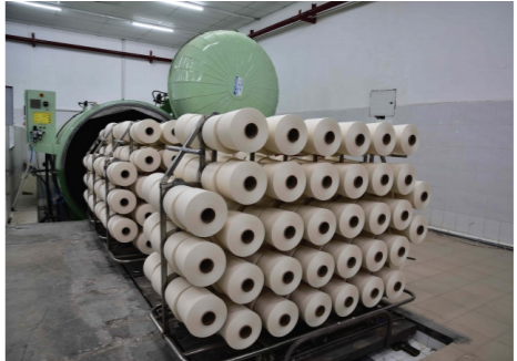
Yarn Conditioning Elgi Make