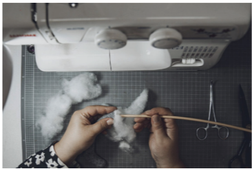
In House Testing Laboratories