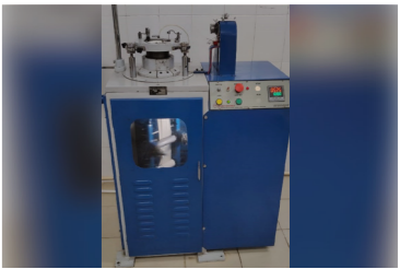
Hose Knitting Machine