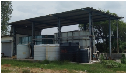
STP (Sewage Treatment Plant)