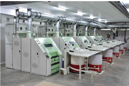
Carding LC 363