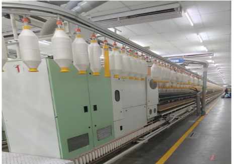
Ring Frames LR9AX, LRJ9AXL