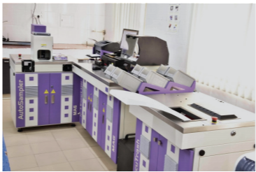
HVI Cotton testing