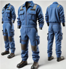
Coverall / Boiler Suit

From high-stress environments to precision tasks, our garments ensure maximum protection and long-lasting performance, making them the trusted choice for industries worldwide.