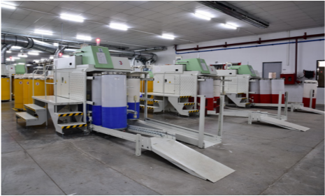
Finisher Draw Frame LDAZ