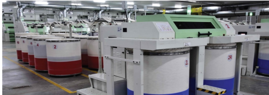
Breaker Draw Frame LD 2