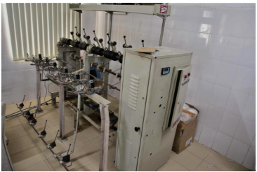
Classmate Testing Machine