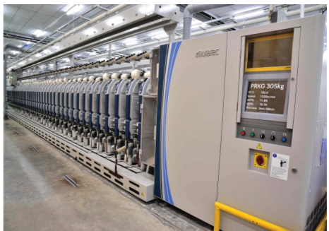
Linkconer MURATA QPRO-PLUS